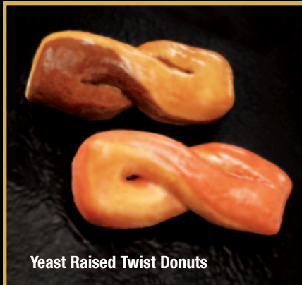
Yeast Raised Twist Donuts