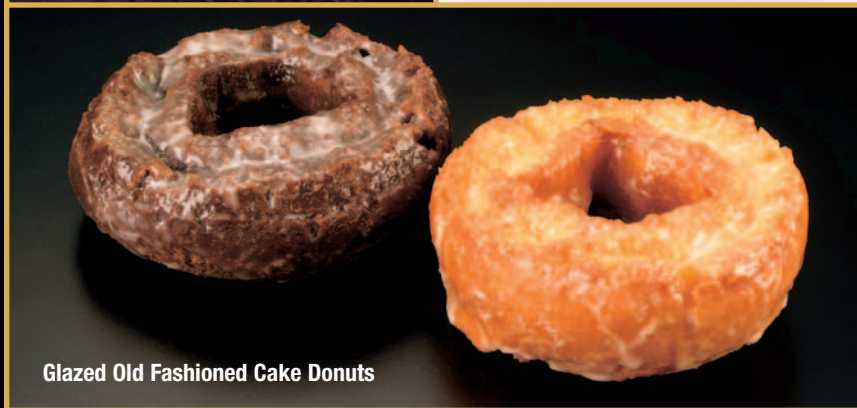
Glazed Old Fashioned Cake Donuts